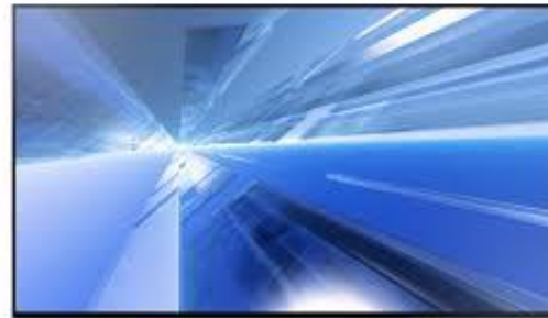
65" ME65C LED Display Screen)