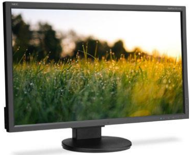
27" NEC LED Screen With stand: 631.4 (w) x 415-545 (h) x 230mm (d)