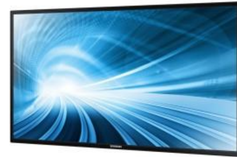
55" ME55C LED Display Screen 1248(w) x 722.4(h) x 29 (D)