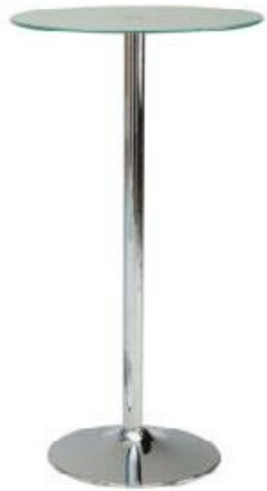
Tall Glass Table Glass top and chrome base. 600mm top x 900mm high