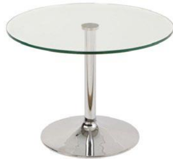
Lower Glass Table Glass top and chrome base. 800mm top x 750mm high