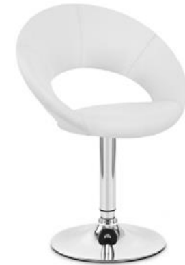
Padded clementine low stool White faux leather. 800mm (h) 400mm (seat height) 400mm (w) x 720mm (d)