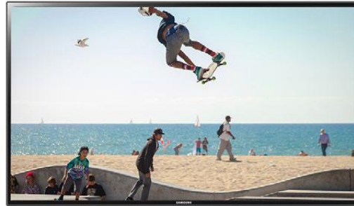
46" Samsung ME460C LED Screen 1057.6 (w) x 615.8 (h) x 29.9mm (d)