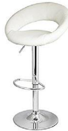
Padded crescent bar stool White faux leather. 600mm (w) x 790mm to 970mm (h)